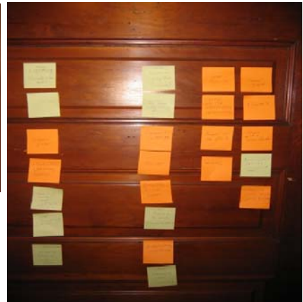
Participants combined and then grouped their answers.